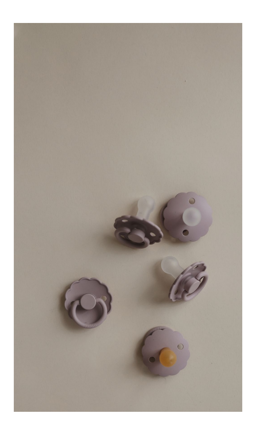
Size 2 6-18 months